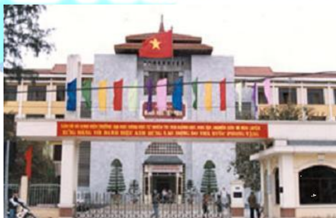
Figure 4: Hanoi University of Science

Due to the long-standing very good relationship between HUS and TUD, Hanoi University of Science was chosen to be the host of the first workshop. At the present moment nearly 50 invitations have been sent to interested persons, which might possibly take part at the workshop. The results and perceptions of the first workshop will influence all following project workshops and the hosts of future project workshops will benefit.