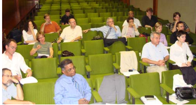
Figure 3: Project partners listening to the introduction

The kickoff-meeting was divided into three days of productive presentation and discussion sessions. On the first day the Management Board (MB) met to finalise the objectives and the next steps within the following periods of the project.