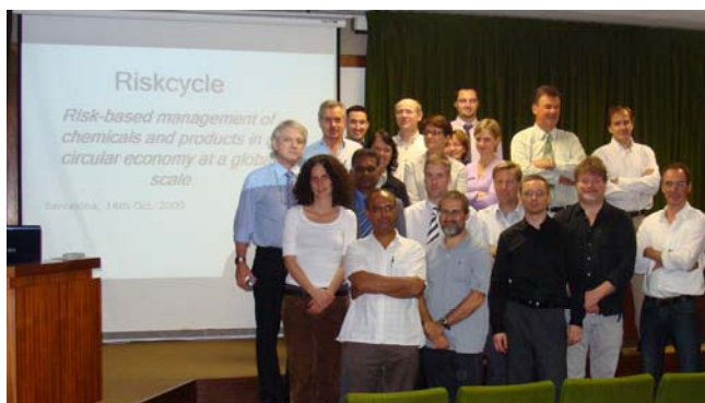
Figure 1: The RISKCYCLE partners in Barcelona

The projects kick off meeting was held from 13 – 15 October 2009 in Barcelona, Spain. It was organised by the coordinator of the project and hosted by partner CSIC. The aim was to align possible different interpretations of the projects tasks from all participating partners and Advisory Board.